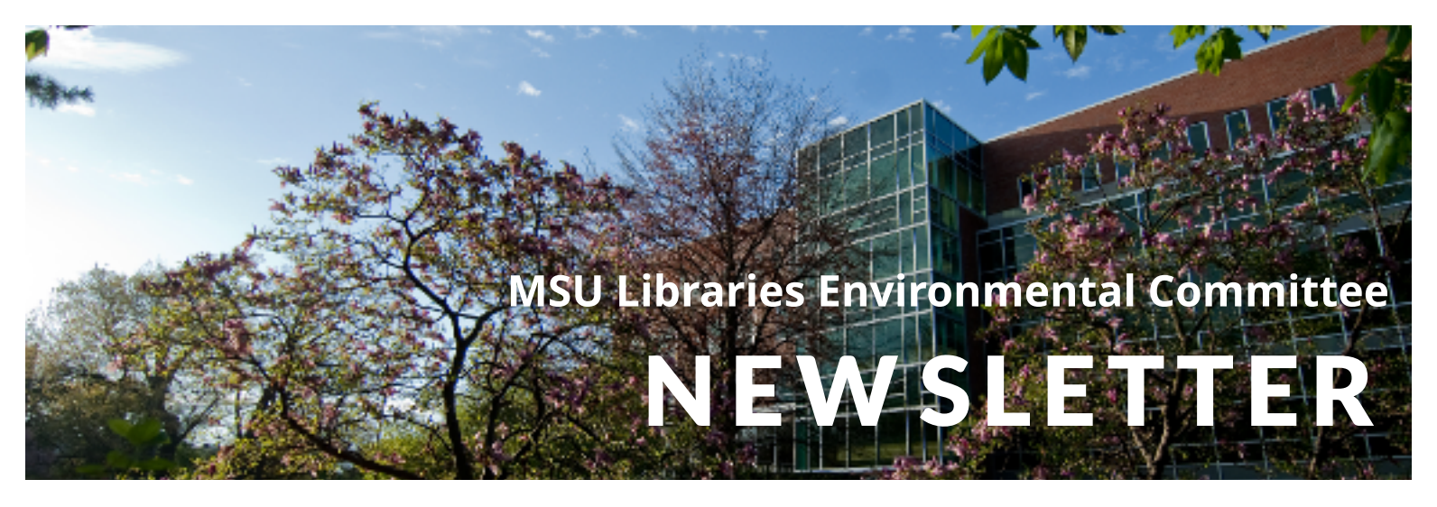
Issue 1 | November 1, 2017